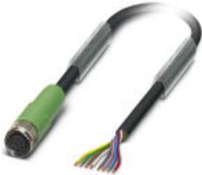
Sensor/Actuator cable, 8-position, PUR, Black RAL 9005, Free cable end, on Socket straight M8, Cable length: 1.5 m

Please be informed that the data shown in this PDF Document is generated from our Online Catalog. Please find the complete data in the user's documentation. Our General Terms of Use for Downloads are valid ( http://download.phoenixcontact.com )